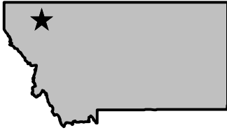
Browning, Montana, Area: 950,643 acres)